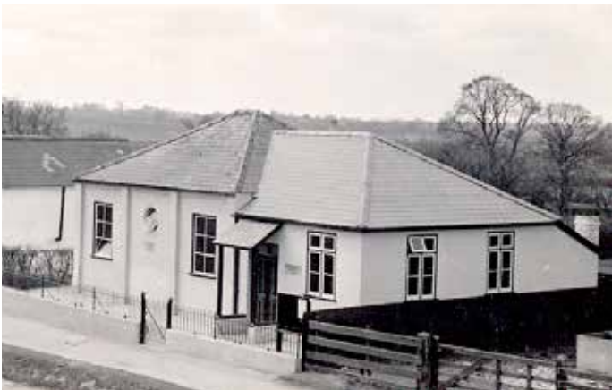
Toft Methodist Chapel circa 1940

Due to the Chapel closing, there will be a Table Top sale on Saturday August 23rd at 10am. We shall be selling an assortment of surplus objects from the Chapel. All monies raised will go to Action for Children.