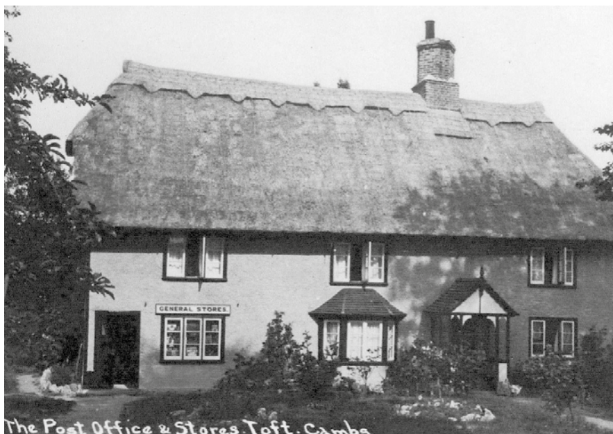
The Post Office & Stores Toft. Cambs