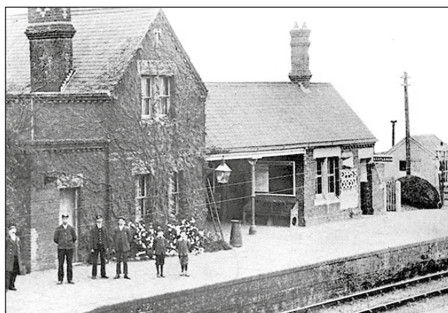
Old North Road Station at Longstowe